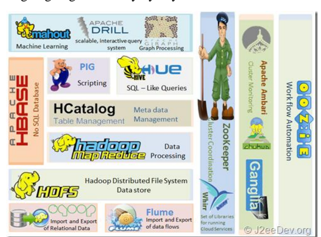
Fig1: Apache Hadoop Eco-System

Before Last few years, industries and organizations didn't which they are commenting and posting their comments. need to store and perform much operations and analytics on data of the customers. However since 2005, the need to transform everything into data is much entertained to satisfy the requirements of the people. So Big data came into picture in the real time business analysis of processing data. Some well-known internet companies like Google, Amazon, LinkedIn, Yahoo! etc. have generated a huge